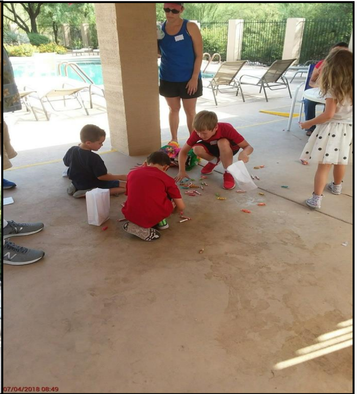
Picking up the candy.