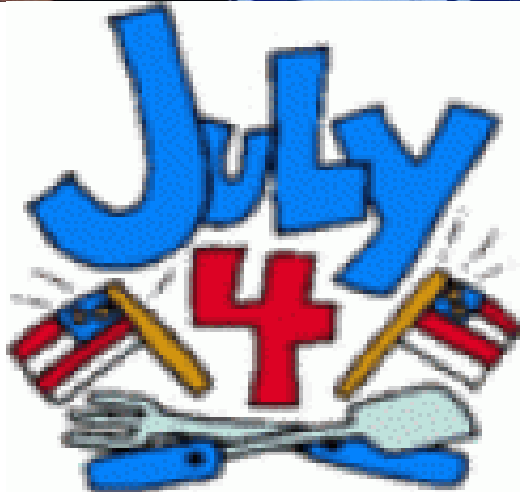
Singing America the Beautiful