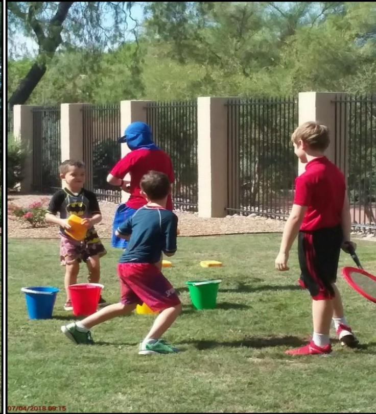
The big fat wet sponge toss and rackets to fend them off

Our Roads: The roads in our neighborhood have wide alligator cracks and some are in front of or near your home and there is a large area of payment missing at the dip on Linden. Any homeowner can go on-line and fill out an on-line form on the City of Tucson's web page at https://www.tucsonaz.gov/tdot/streets-traffic-maintenance The City asks for location, description of the problem, your name & address and e-mail. They will send you an e-mail acknowledging receipt of your request with a confirmation # and another when the job is completed. This is how FPHOA requests the painting of stripes on our speed bumps as well as signage repair. Their reported turnaround time of completion is 3-days. We all need to do our part in keeping our streets in the best condition we can. It could be many years before the City has the monies to pave our streets. (Thank you to whoever put in the request for the recent repair work done on Chauncey.)