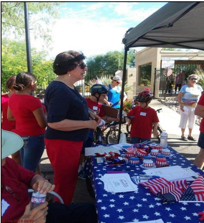
The sign in table